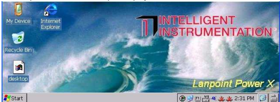
LANpoint Power X & TIMEpoint Power Desktop screen

This concludes the power-up sequence and the unit is ready to use.